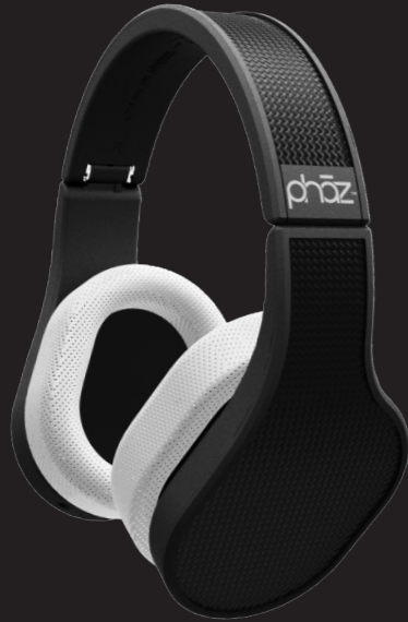
User Guide for PHP2 Headphones