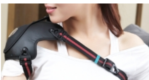
Straps: 2 straps for knee / elbow, 1 strap for shoulder