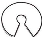
Comfort padding cover